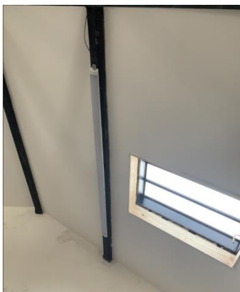
3 Ceiling Insulation