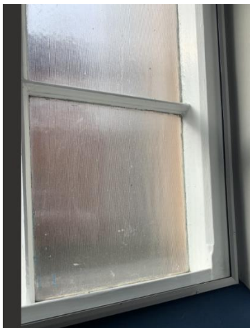
1 Secondary Glazing